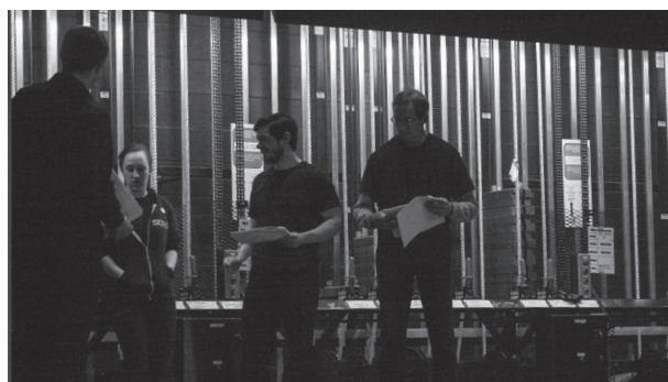
Backstage crew preparing for a performance

LCT appreciates those businesses and specialists who offer their services to aid in our success. Do you have something you could provide? Perhaps you have some old equipment or spare supplies that might be of use. Please contact our executive director if you have a suggestion.